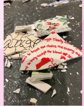
Women wrote lies they believe about themselves and about God on plates, only to be smashed by the

who delights in us. Finally, we were reminded that we are God's masterpieces, made for good works that God has already for us to take part in; the key understanding that we cannot enjoy those works if we are not sitting and standing in the truth of who we are in Christ. In addition, we all participated in intentional activities that brought struggles and damaging beliefs to the light, and were able to stand up for each other and smash those false beliefs to the ground (see photo). In the end, women left lifted up by the community and one woman even prayed to receive Christ for the first time, praise God and alleluia!